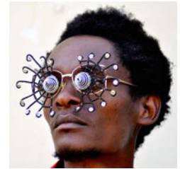
Cyrus Kabiru Artist & TED Fellow

In 2014, the YWI team is ramping up to reveal deeper story detail with five new startups we profiled last winter.