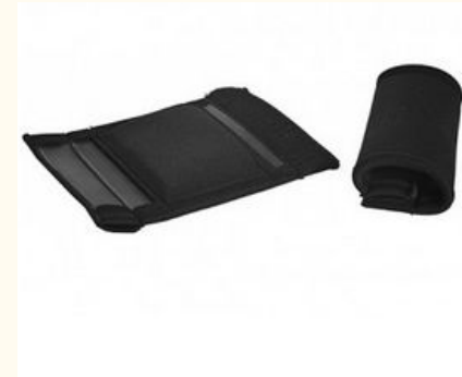
Gel Walker Handle Covers