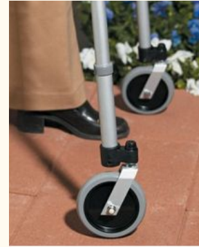
Swivel Caster w/Footpiece for Walkers