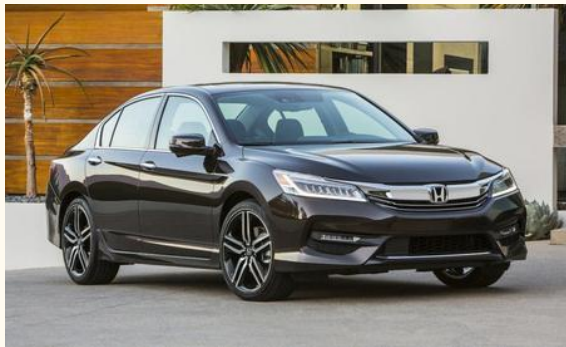
She owns Honda Accord