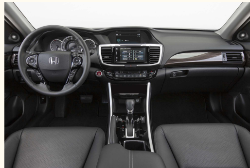
Honda Accord - interior