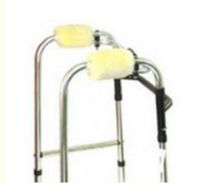
Genuine Sheepskin Walker