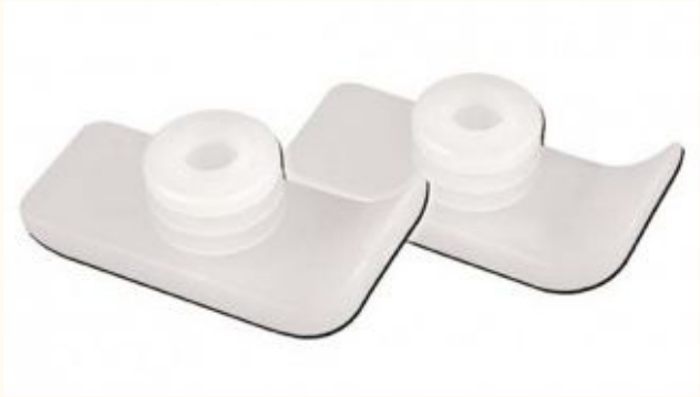
Walker Glide Skis